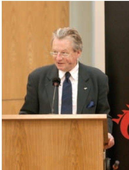
Lord Dafydd Elis-Thomas

The meeting was opened by Lord Elis-Thomas, who praised the actions of South Wales Police at the scene of the recent mining accident in Swansea Valley in which four miners lost their lives. He said the police response was excellent over the period of the rescue attempt and that it was clear they understood their